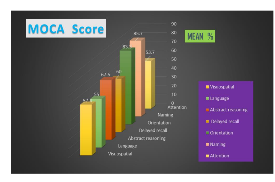
MOCA: Montreal Cognitive Assessment

Figure 2 : depicts the percentage of cognitive domains of MOCA that were negatively impacted in the research group's assessment of cognitive function.